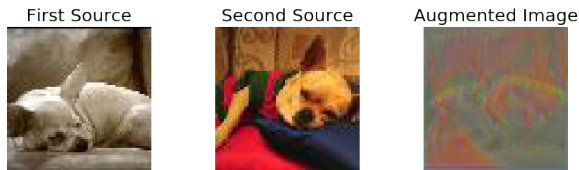
Figure X: Dog sample IV

that the color is faded and the background noise is faded out. Regarding colors, orange background colors in dog images are always picked up in the background to contrast images of goldfish. The next figure shows this property where the yellow wall paper is transformed into an orange hue. It's really fascinating that despite the dogs' ears matching the tones of the background in both source images, the augmented image picks up on those details and colors them greenish in contrast to the orange background.