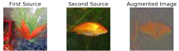
Figure VI: Goldfish sample II

The sampling for dogs is quite similar. The augmented image picks up the characteristics of the second source image while preserving only the contours of the other dog. Features such as the contours of the nose and the legs of the other dog are somewhat visible.