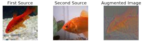
Figure V: Goldfish sample I

Some of the images generated by neural augmentation are quite remarkable. In most cases, the augmented images are a combination of the source images. The neural picks out the golden bodies of the fish and merges them together. For instance, in sample II, the neural augmentation picks out the large goldfish in the second source image and the orange fish on the left in the first source image while smoothing out the background grass.