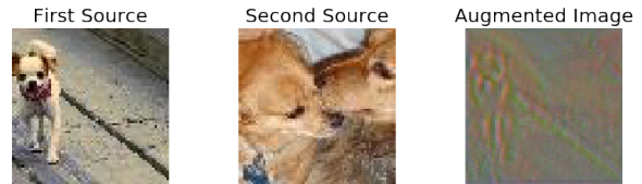
Figure IX: Dog sample III

In all cases, it seems that the generated images that best improve performance have some form of regularization so