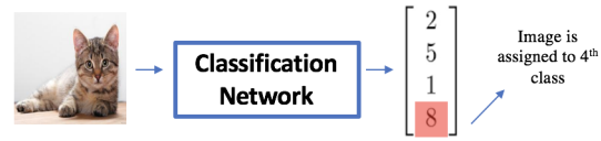
Figure IV: Testing/Validation model

At training time, we generate a batch of images called the training batch. This image is fed into SmallNet and gradients are back-propagated to help improve SmallNet. Subsequently, pairs of images are randomly sampled from the same class and fed into AugNet to generate an augmented image which is passed into SmallNet. The weights of both neural nets are updated. At test time, images are fed into SmallNet, which does all the work to classify the image.