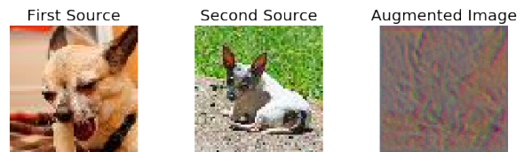
Figure VIII: Dog sample II

However not all augmented images have any visual meaning. Even though no defining shape of dogs are created in the following two images, the augmented images are a bunch of contours of ears and legs which are defining characteristics of the dog.