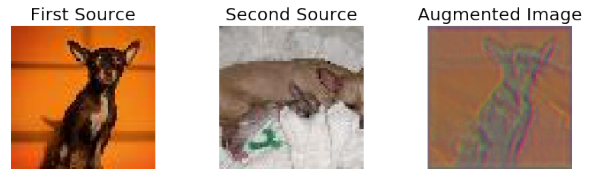
Figure VII: Dog sample I

The sampling for dogs is quite similar. The augmented image picks up the characteristics of the second source image while preserving only the contours of the other dog. Features such as the contours of the nose and the legs of the other dog are somewhat visible.