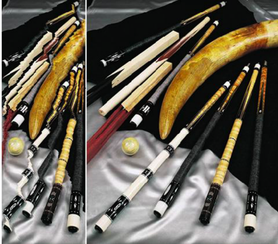
(a) Dynamic Programming