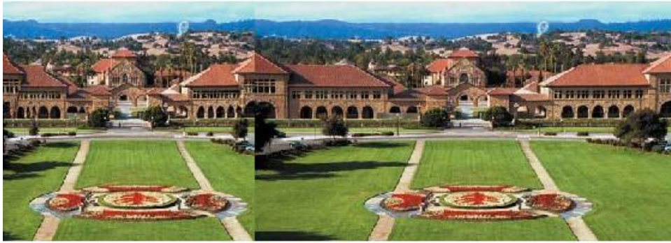
(a) Dynamic Programming