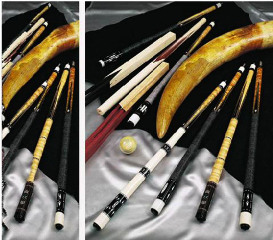
(b) Greedy 20