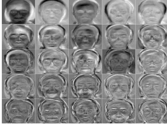
Figure 1: Example facespace

In other words we'd like to fit the points to a straight line, as close as possible such that d_t is minimized.