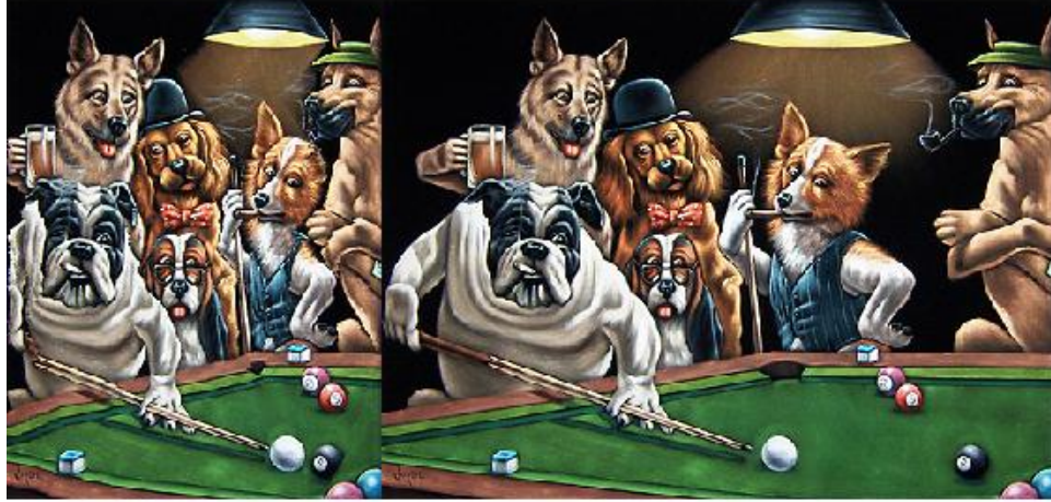
(a) Dynamic Programming