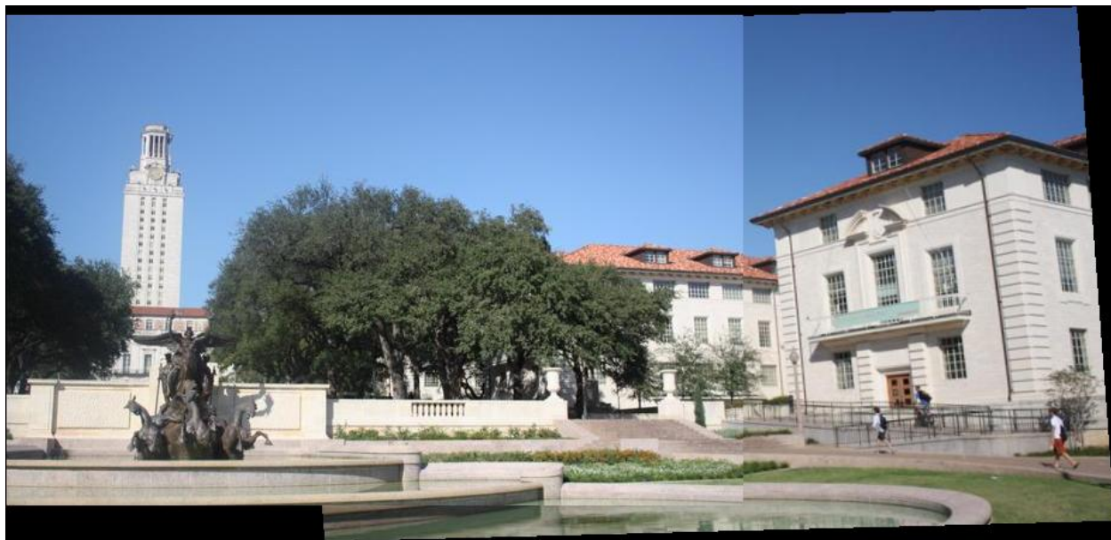
Figure 1: Stitched result from two images

where \|\cdot\|_2 is the Euclidean distance, as defined in part 3 above. After you finish RANSACFit.m , you can test your code by running TransformationTester.m . You should get very similar results to Figure 1.